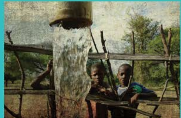
Successful well provides clean water.

We are doing our best to develop an approach that empowers the communities rather than creating dependence. There are certainly many approaches within non-profit circles and it is a constant matter of debate to determine which one works best. What I've come to understand is that not every attempt