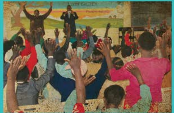
Women asking forgiveness.

"Respected officer. We know now that we have brought darkness into our homes and community. We have injured families and some have even died because of the alcohol we have made. We have discovered many things through this week of training with the greatest being Christ and His forgiveness. We will not brew anymore. Let no more die because of us. We ask your forgiveness for what we have done."